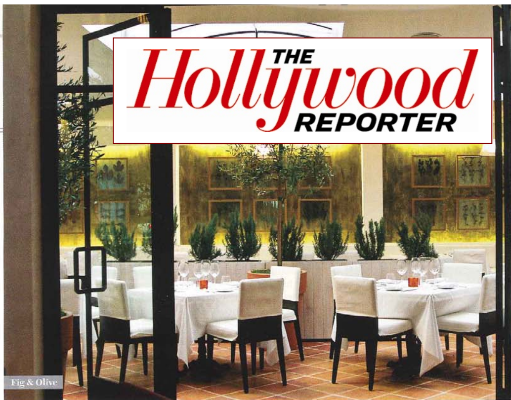
Fig & Olive